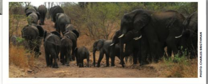
There is so much more to Victoria Falls than just the Falls themselves – the Zambezi National Park has abundant wildlife and excellent guides; visitors will not be disappointed